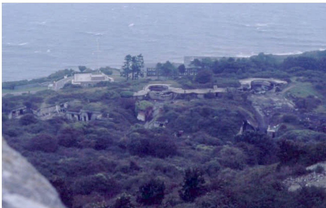
Left - Detention Barracks Right - B Battery