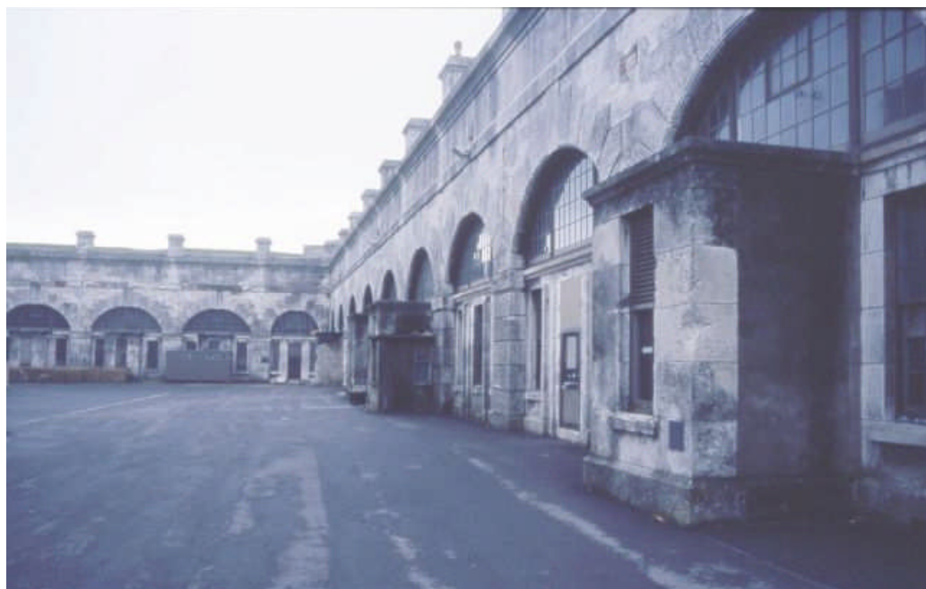
South Lower Flank Battery 1992