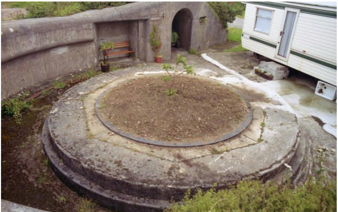
12.5-inch RML emplacement