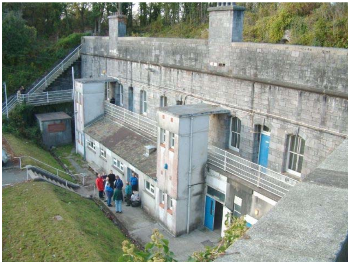
Barrack Block Woodlands Fort